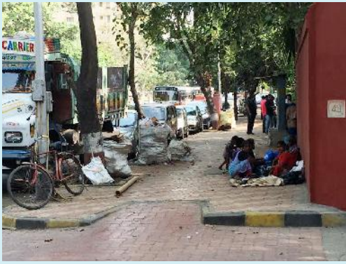
The BMC should start their “Swachh Bharat” drive here!