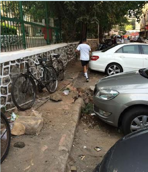
Peddaling for pavements. NSRCF has endeavoured to create and maintain our pavements enabling a safe and healthier lifestyle for citizens.